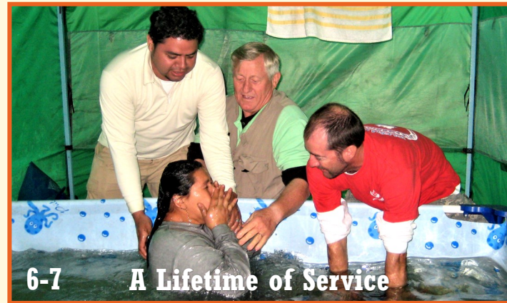
6-7 A Lifetime of Service