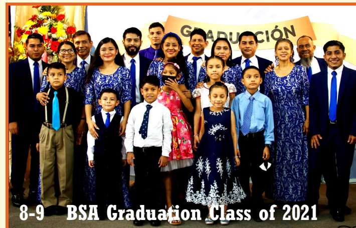
8-9 BSA Graduation Class of 2021