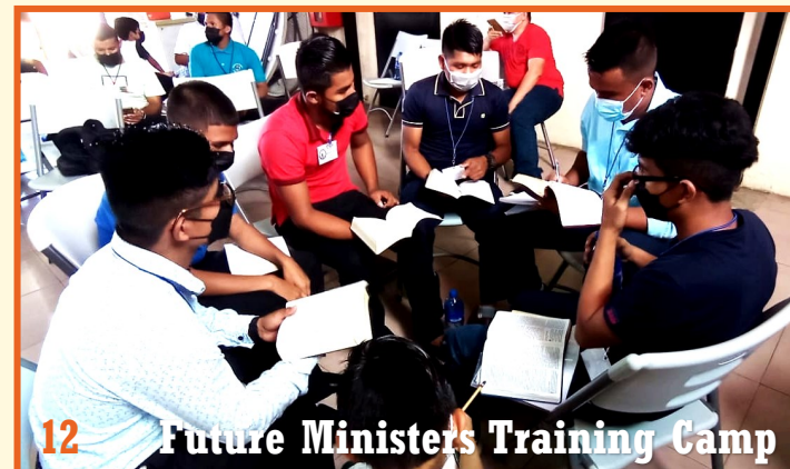
12 Future Ministers Training Camp