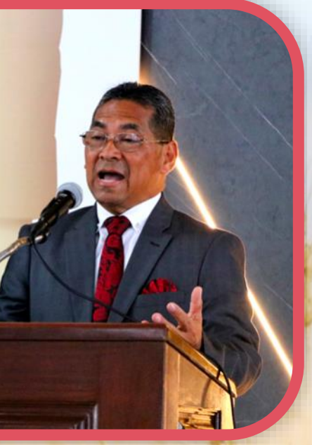
addresses the audience during tes for English-speaking attendees.